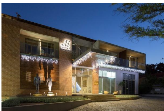
Menlyn Boutique Hotel

Distance from the University: 3 km ~ 5 – 7 minute drive