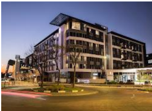
The Capital Menlyn Maine

Contact: +27 12 942 5000 or +27 10 446 8045