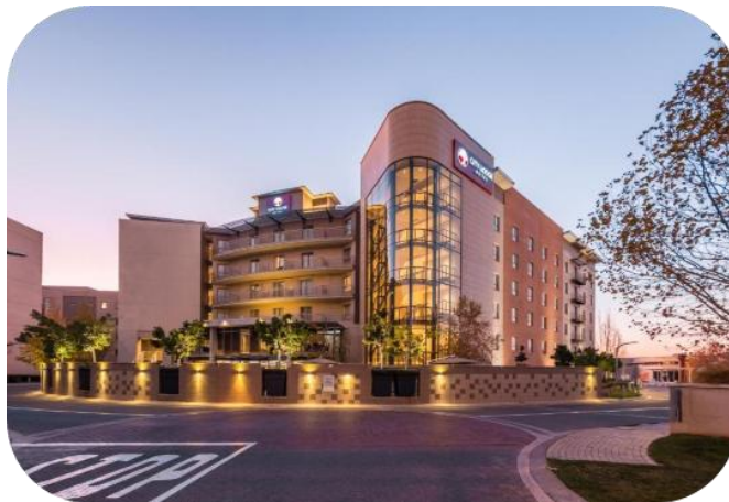
City Lodge Hotel Lynwood