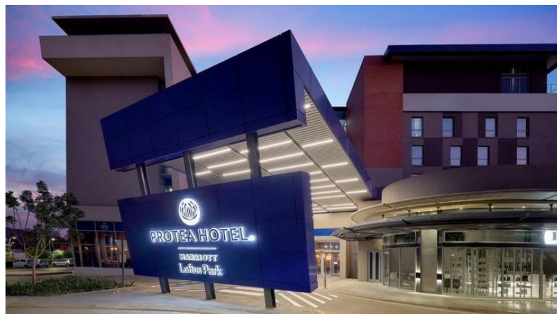
Protea Hotel by Marriott Pretoria Loftus Park

Distance from the University: 2.4 km ~ 3 minute drive